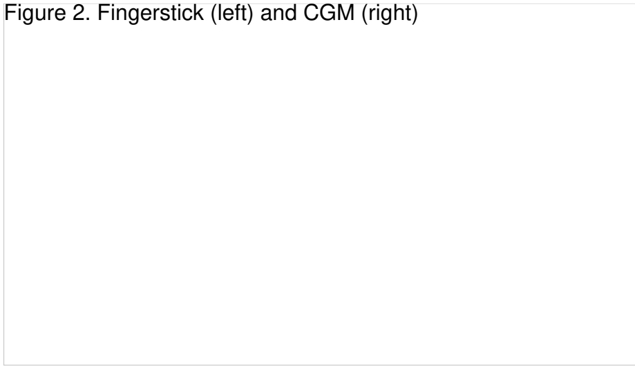
Figure 2. Fingertick (left) and CGM (right)