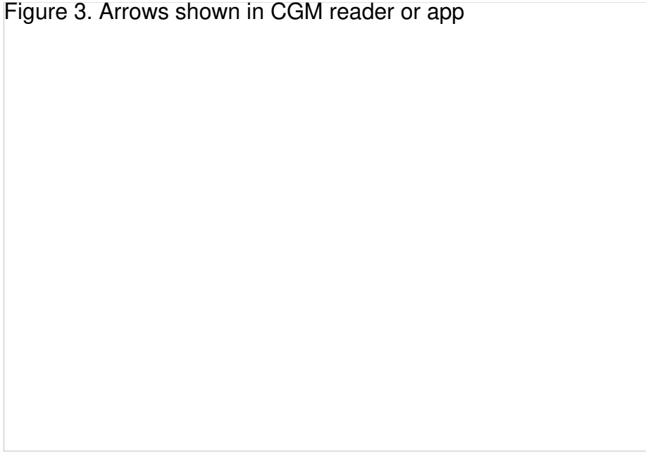
Figure 3. Arrows shown in CGM reader or app