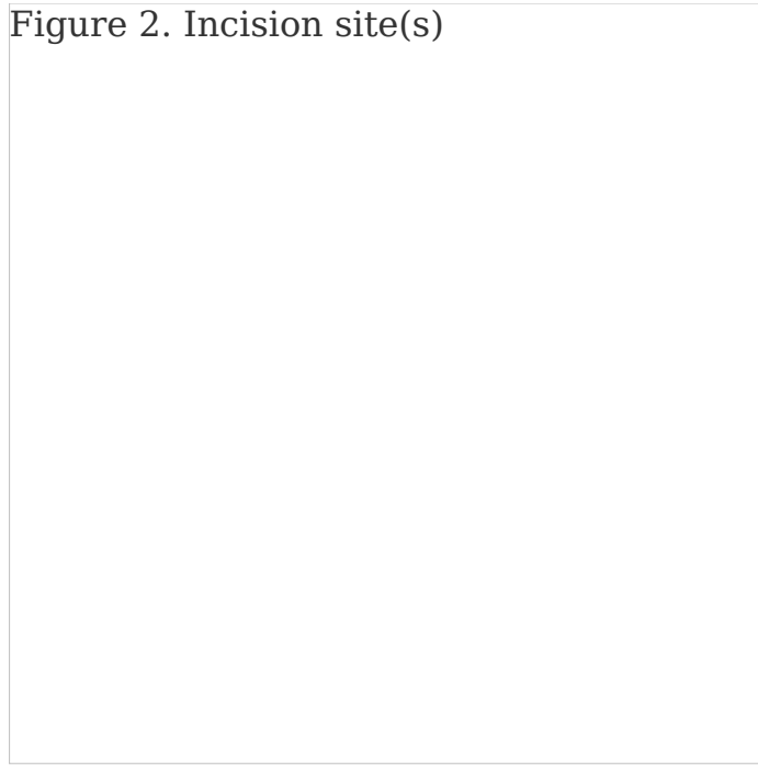
Figure 2. Incision site(s)

Once the pleuroscope is in your pleural cavity, your doctor may do a biopsy, drain fluid, or do a pleurodesis. They may do all 3 things.