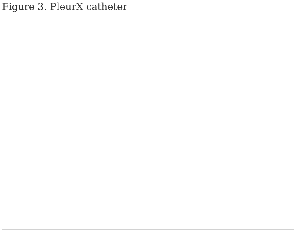
Figure 3. PleurX catheter

The pleuroscopy usually takes about 40 to 60 minutes.