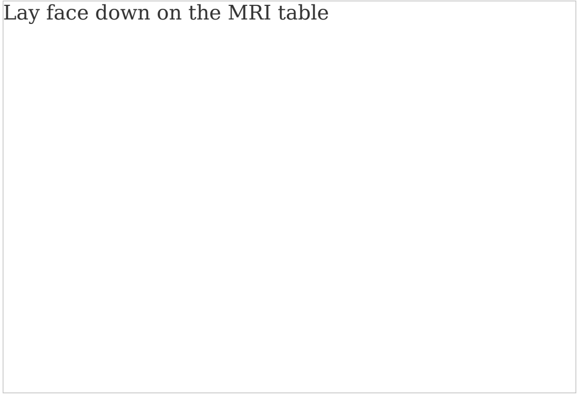
Figure 1. Lay face down on the MRI table

You'll lay face down on the MRI table during your breast MRI (see Figure 1). Your breasts will fit into cushioned holes in the table (see Figure 2).