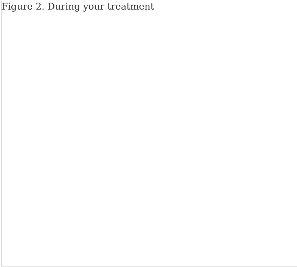
Figure 2. During your treatment

Once you're in the right position, your radiation therapists will leave the room, close the door, and start your treatment. They'll take beam films to make sure you're in the right position. Your radiation oncologist may use these to adjust your treatment.