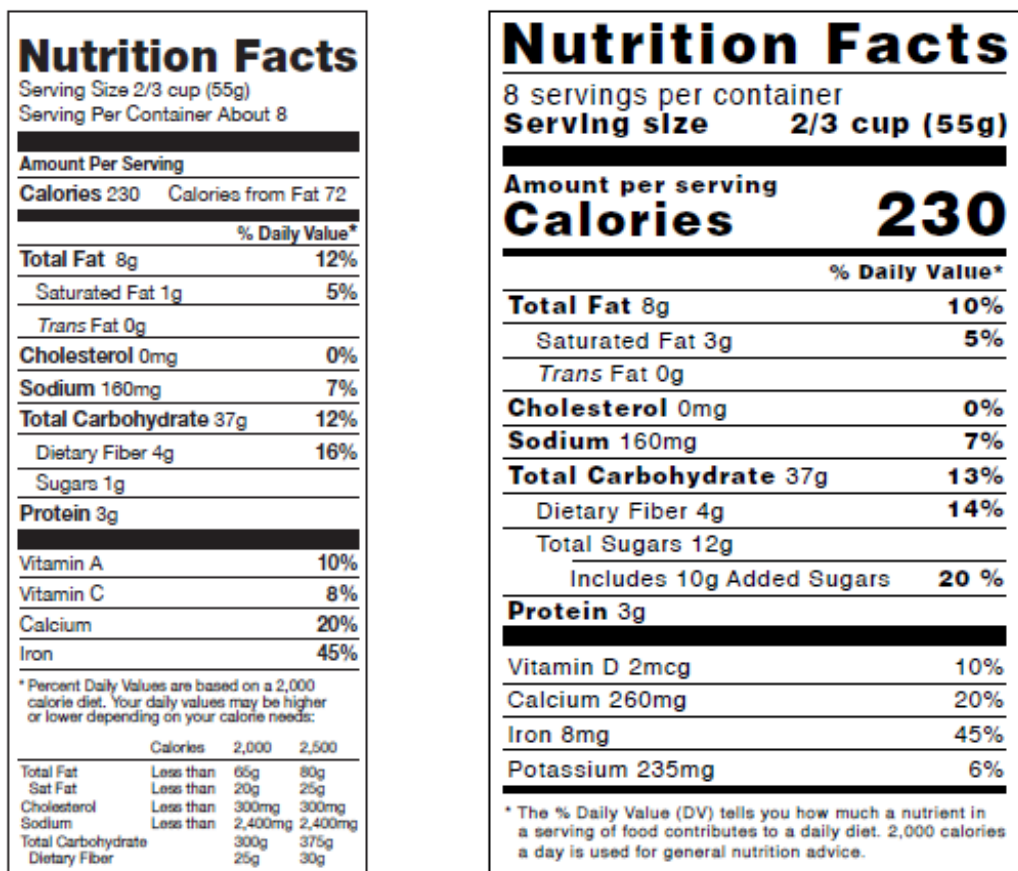
Figure 4. Food labels

Here are some examples of food labels (see Figure 4).