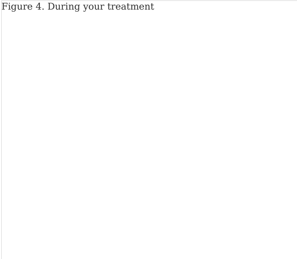
Figure 4. During your treatment

Once you're positioned correctly, your radiation therapists will leave the room, close the door, and begin your treatment. You won't see or feel the radiation, but you may hear the machine as it moves around you and is turned on and off. You'll be in the treatment room for 15 to 90 minutes, depending on your treatment plan. Most of this time will be spent putting you in the correct position.